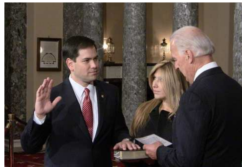
Sen. Rubio is sworn in by Vice Pres. Biden