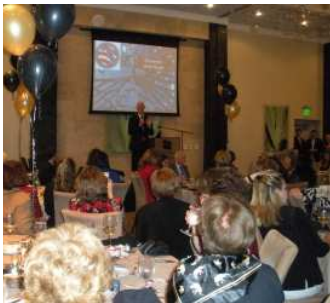
Gov Rick Scott speaking

The theme, "Shattering the Glass Ceiling," was well met. It was an awesome three days of networking, meeting new friends, renewing old acquaintances and a packed fast-paced agenda. We even picked up one NORWF associate member. Your president was named parliamentarian for the upcoming FFRW convention in Orlando. Details are just starting to become available, so stay tuned for more information on that. You will also be receiving information on legislation that the FFRW will be backing so you can be educated and then educate others. I would certainly hope that each member will consider attending the future meetings and conventions of FFRW. You will be exhausted at the end, but you will certainly be well-informed and energized.