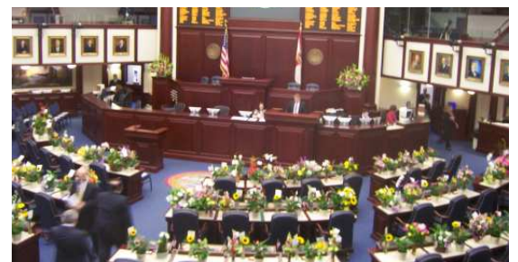
Chamber ready for opening session